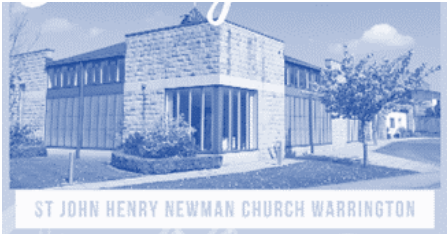
ST JOHN HENRY NEWMAN CHURCH WARRINGTON