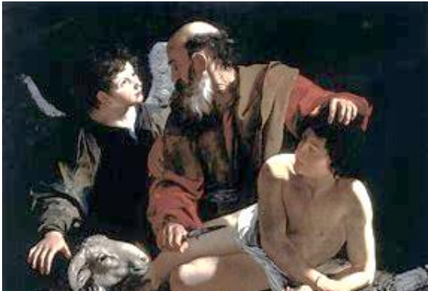
Sacrifice of Abraham - Carravaggio

What is our first impulse when we are given a gift? Our instinctual response is: “I can’t take this! I don’t deserve this!” In essence, that gesture, that healthy instinctual response, is an attempt to give the gift back to its giver.